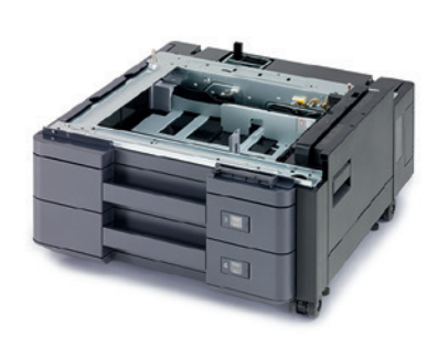
FEEDER PF-7100 Ideal for paper sizes between A6 and SRA3 (320 x 450 mm).