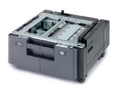
2X 1,500-SHEET PAPER FEEDER PF-7110 Supports A4, B5 and letter formats.