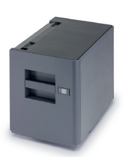
3,000-SHEET PAPER FEEDER PF-7120 Ideal for large print runs in A4.